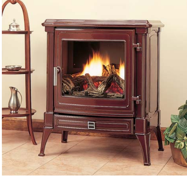
DCS brown enamel cast iron stove shown with unique bow front operable door with a mesh screen.

The Monessen line of vent-free gas stoves offers you a broad selection of high quality cast and steel stoves. From precision crafted European cast iron stoves to contemporary heavy-duty, all steel stoves, Monessen has combined the charm of a wood-burning stove with the latest in gas space heating technology and the clean burning convenience of gas without the wood mess. Style, craftsmanship and performance ensure years of reliable, dependable comfort.