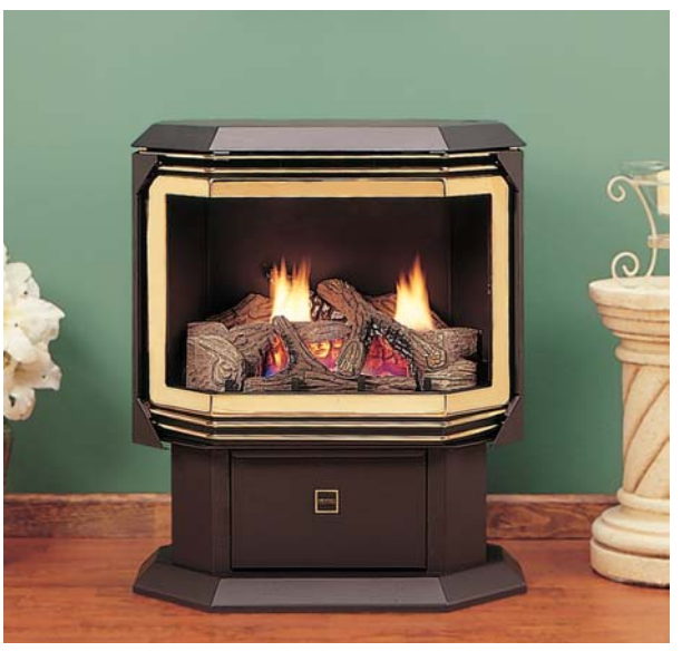
DSS steel stove shown in metallic black finish with optional gold-plated door frame.