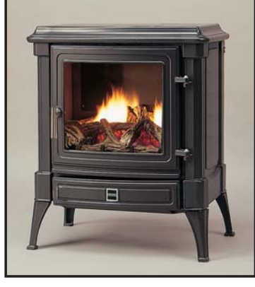
Satin Black Enamel