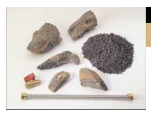
Standard feature components