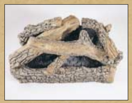
Solid, unitized log set is intricately detailed

You can rest assured that your new Yukon is the safest vent free gas log heater available. In addition to standard oxygen depletion safety controls, and industry-leading, clean flame combustion technology, the entire log set and ember bed is unitized in a pre-assembled arrangement. This feature assures maximum performance and eliminates the possibility of log misplacement or movement, and potential degradation of indoor air quality. The control and gas train are 100% factory assembled and tested.