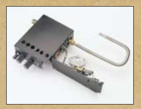
Gas train/ control assembly is fully assembled and factory tested