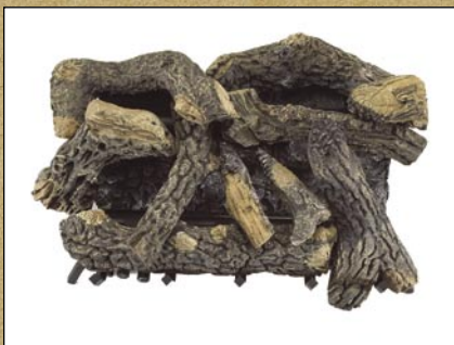
Solid, unitized log arrangement is intricately detailed.