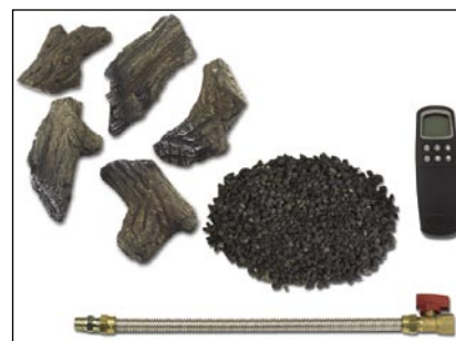
Standard feature components