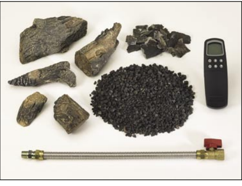
Standard feature components include hand-held, multi-function remote control