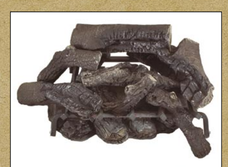
Solid, unitized log arrangement is intricately detailed.

Design Dynamics goes above and beyond when it comes to safety of our products. In addition to industry-leading, clean flame combustion technology, the Hardwood includes a millivolt safety gas control with multi-function remote, and matchless, piezo ignition. The control and gas train are 100% factory assembled and tested.