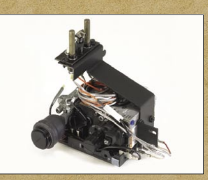
Gas train/ control assembly is fully assembled and factory tested.