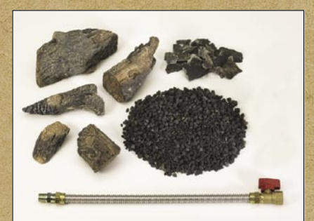
Standard feature components