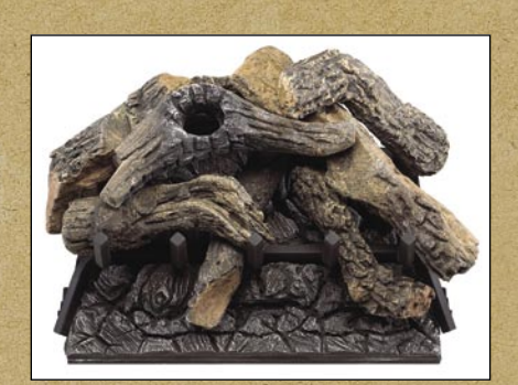
Solid, unitized log arrangement is intricately detailed.

The Cascade's low profile, ember ramp burner creates the warm yellow flame patterns and deep smoldering glow that takes a wood fire hours to accomplish. The intricately detailed, log stack, log scraps, ember chips, and cascading ember bed burner are painstakingly recreated from an actual wood fire; complete with logs, coals and embers. The entire system is hand finished in natural wood tones and smoky, charred details for a true to life, wood fire presentation.