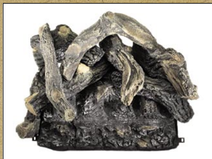
Solid, unitized log arrangement is intricately detailed.