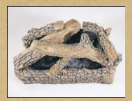
Solid, unitized log set is intricately detailed

Design Dynamics goes above and beyond when it comes to safety of our products. In addition to industry-leading, clean flame combustion technology, the Arcadia includes an easy access, remote-ready millivolt gas safety control with matchless, piezo ignition. The control and gas train are 100% factory assembled and tested.