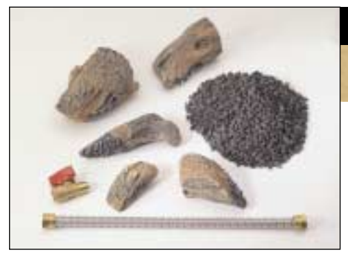
Standard feature components