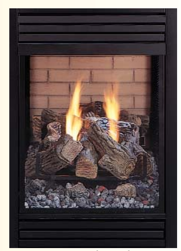
GFP36 Peninsula End View.