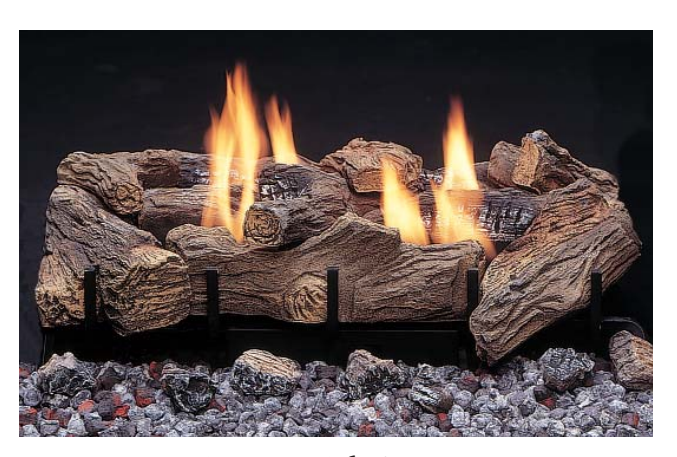
DST Vent Free Gas Logs - Side A