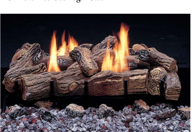
DST Vent Free Gas Logs - Side B