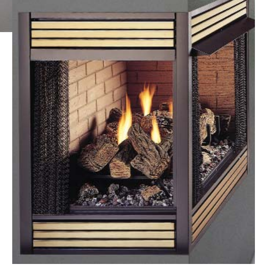
Corner Firebox shown with brass louvers.