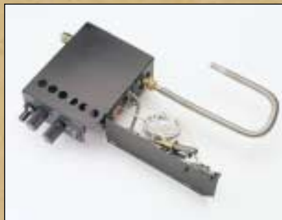
Gas train/ control assembly is fully assembled and factory tested