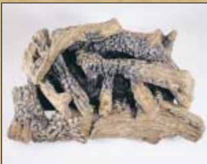
Solid, unitized log set is intricately detailed