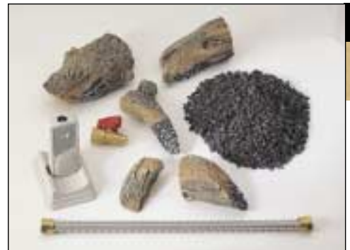
Standard feature components include hand-held remote control