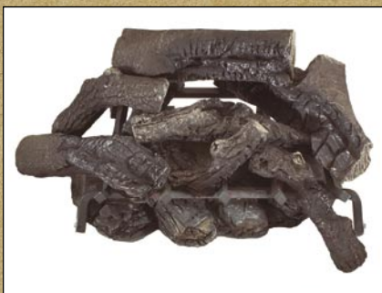
Solid, unitized log arrangement is intricately detailed.

Design Dynamics goes above and beyond when it comes to safety of our products. In addition to industry-leading, clean flame combustion technology, the Hardwood includes a millivolt safety gas control with multi-function remote, and matchless, piezo ignition. The control and gas train are 100% factory assembled and tested.