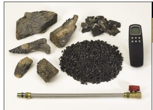
Standard feature components include hand-held, multi-function remote control