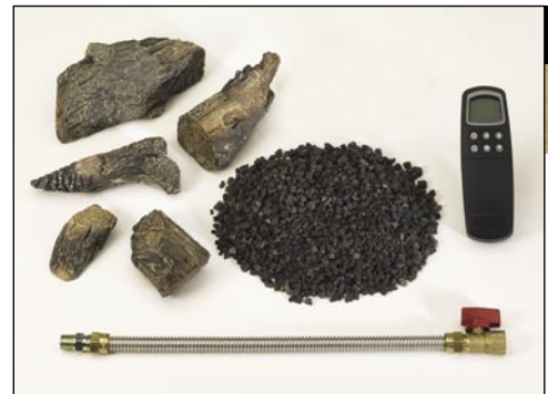
Standard feature components include hand-held, multi-function remote control