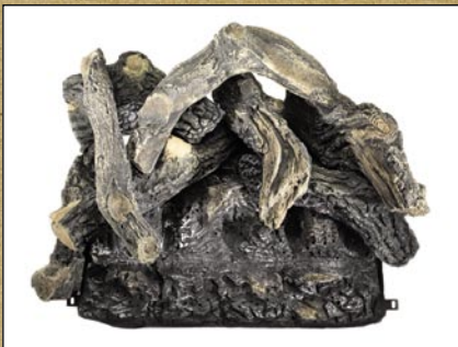
Solid, unitized log set is intricately detailed.